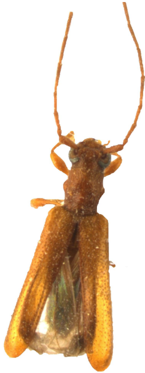
Fig. 2. Imago of Axinopalpis gracilis (Kryn) (Latvia: Ilgas)

broadened in the hinder part, its sides are not parallel, its body and legs are dark, the upper part has shorter setae.