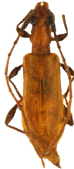
Fig. 3. Imago of Obrium cantharinum (L.) (Latvia: Dunava)