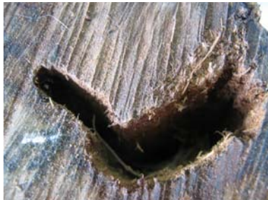
Figure 4. The damage of larvae in the wood.