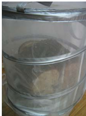
Figure 1. Tree pieces into rearing boxes.