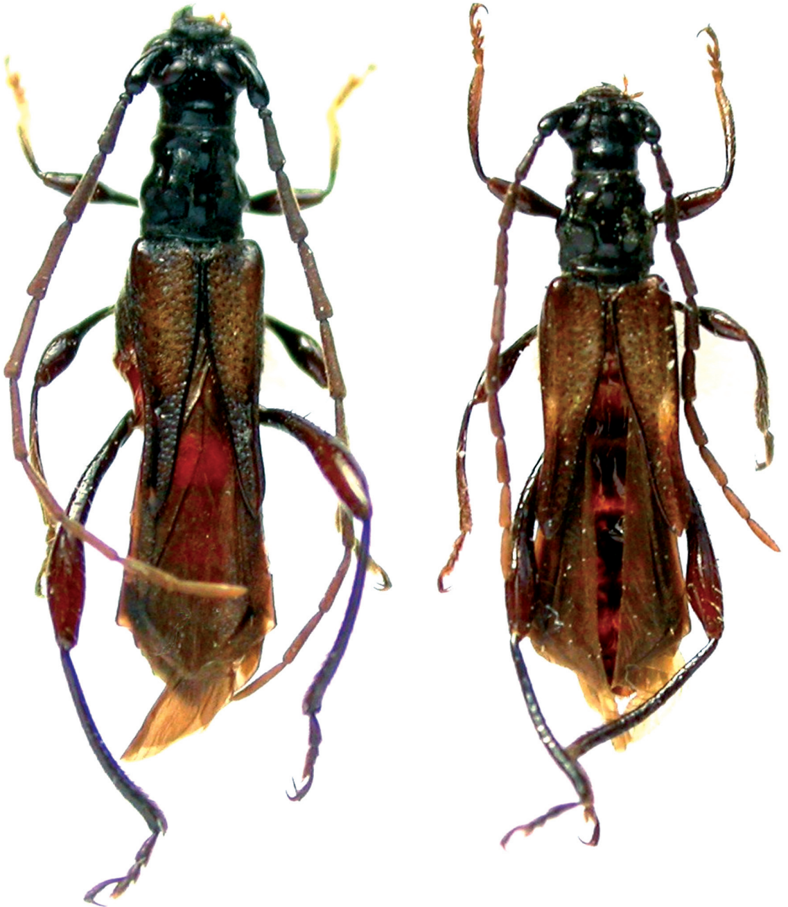
FIGURE 1: Oxylopebus brachypterus sp. nov., paratypes: ♂, 8.1 mm (left), ♀ 7,7 mm (right).

the longest, greatly enlarged and strengthened, especially in female, not quite reaching apex of abdomen. Tibiae curved, lacking carina nor sulcate; protibia only slightly curved, slightly widening before apex, apex with small, inconspicuous mesal spine; mesotibia strongly curved, gradually widened to apex, apex with two small spines, the lateral one indistinct; metatibia distinctly curved, apex with two spines, the lateral one