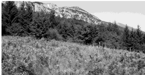
Figure 2. The foothill of Rtanj Mt. (photo Milan Đurić).