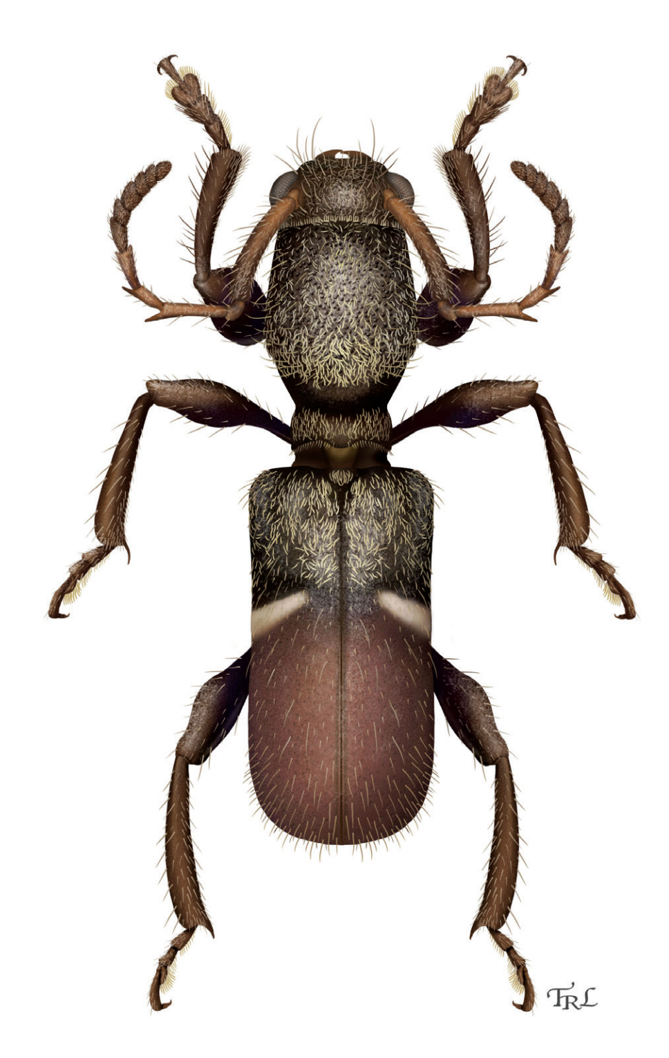
Figure 1. Licracantha formicaria sp. n., dorsal habitus. Digital painting by Taina Litwak.