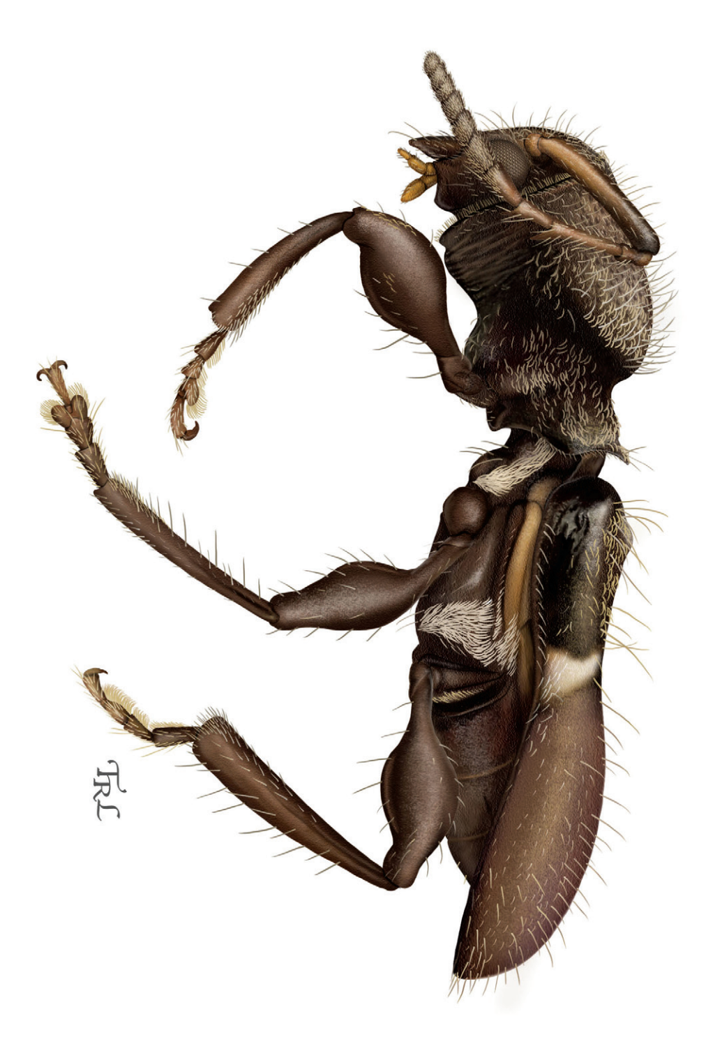
Figure 2. Licracantha formicaria sp. n., lateral habitus. Digital painting by Taina Litwak.