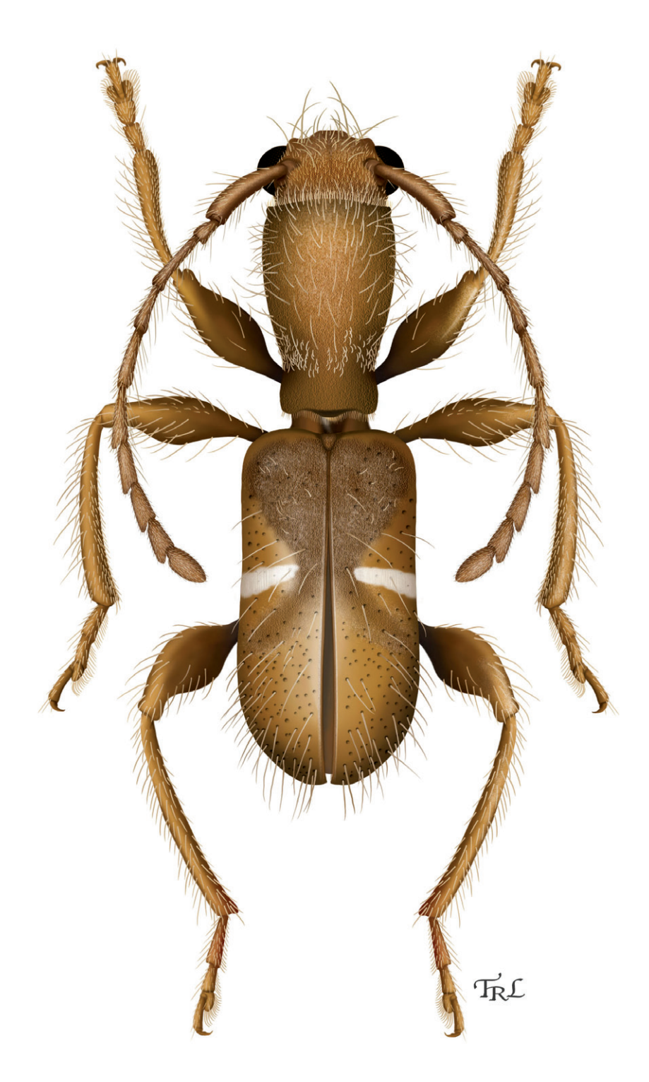
Figure 4. Tilloclytus baoruco sp. n., dorsal habitus. Digital painting by Taina Litwak.