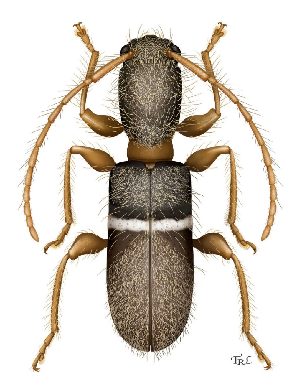
Figure 5. Tilloclytus neiba sp. n., dorsal habitus. Digital painting by Taina Litwak.