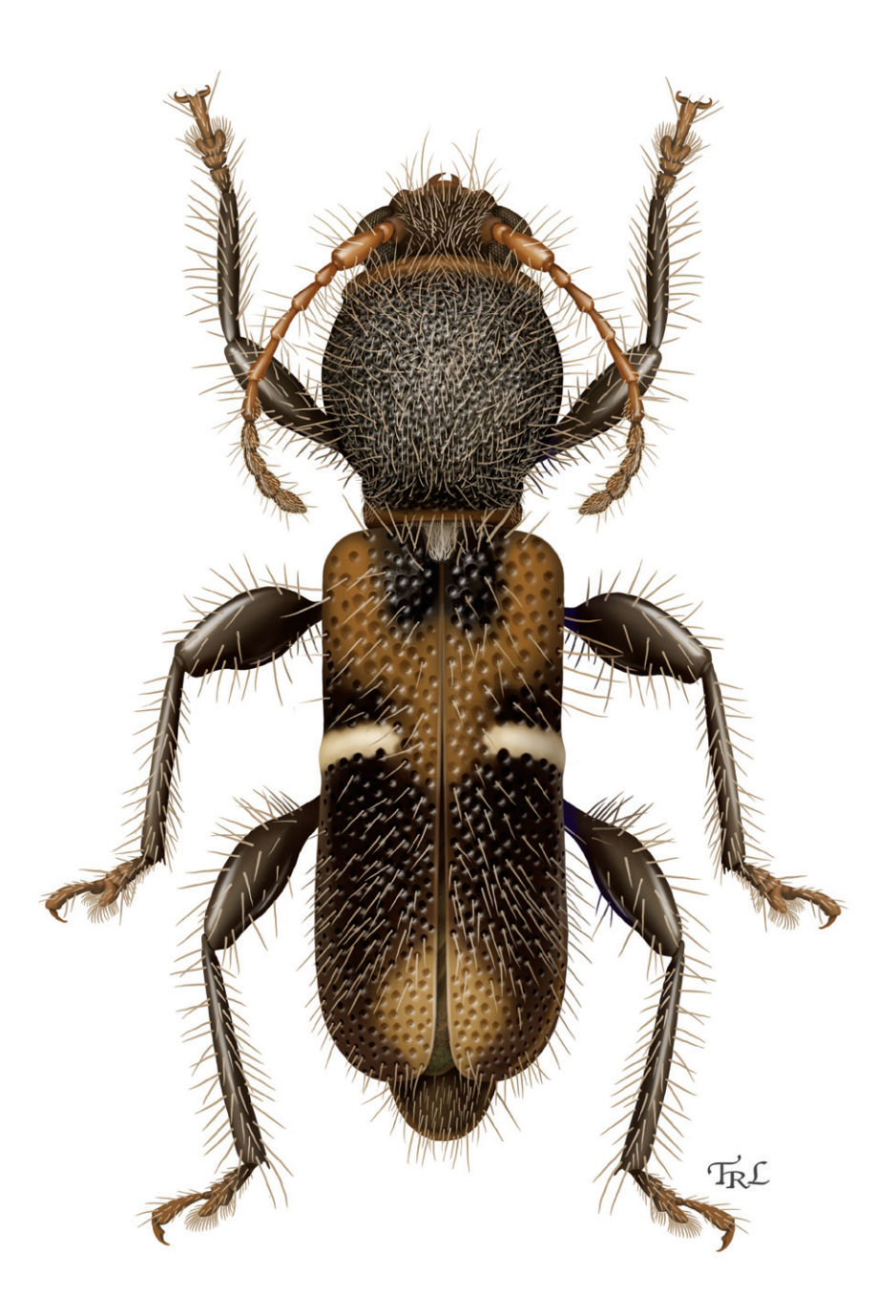
Figure 3. Calliclytus macoris sp. n., dorsal habitus. Digital painting by Taina Litwak.