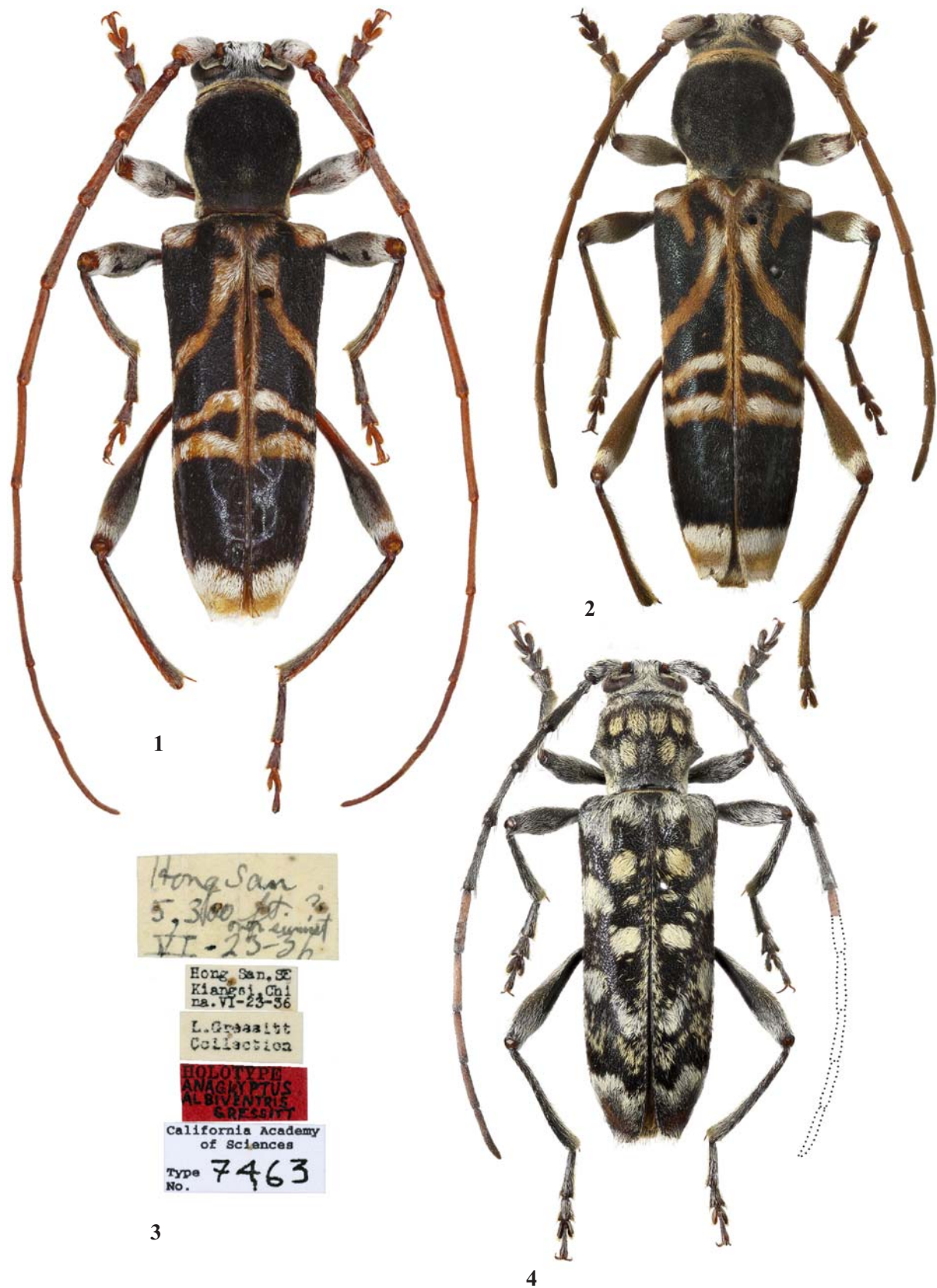
Figs 1–4. Paraclytus spp.: 1–3 — P. albiventris ; 4 — P. thibetanus ; 1, 4 — male (1 — holotype); 2 — female; 3 — labels of holotype. Рис. 1–4. Paraclytus spp.: 1–3 — P. albiventris ; 4 — P. thibetanus ; 1, 4 — самец (1 — голотип); 2 — самка; 3 — этикетки голотипа.