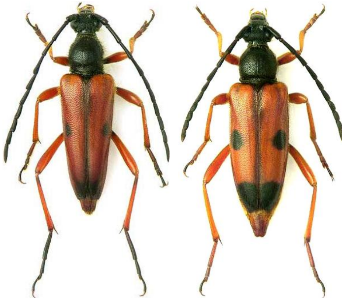
Figure 1. Stictoleptura rufa (Brullé, 1832) from Greece: ♂ (left) and ♀ (right).