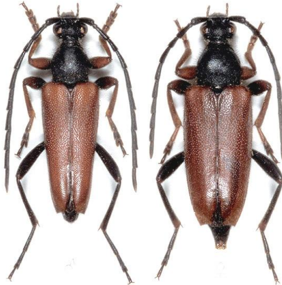
Figure 4. Stictoleptura erythroptera (Hagenbach, 1822) from South Moravia (Czech Republic): ♂ (left) and ♀ (right).