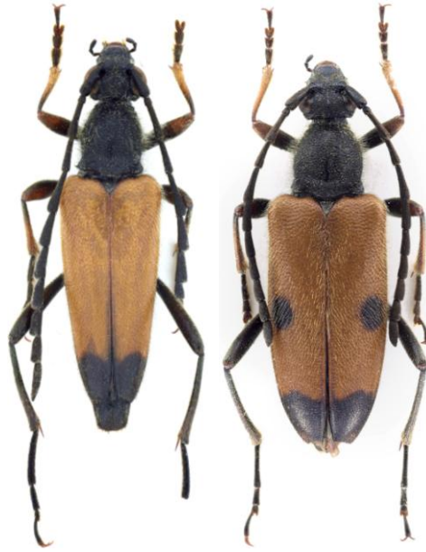
Figure 3. Stictoleptura slamai Sama, 2010 ( Brachyleptura martini Sláma, 1985) Holotype ♂ (left) and Allotype ♀ (right).