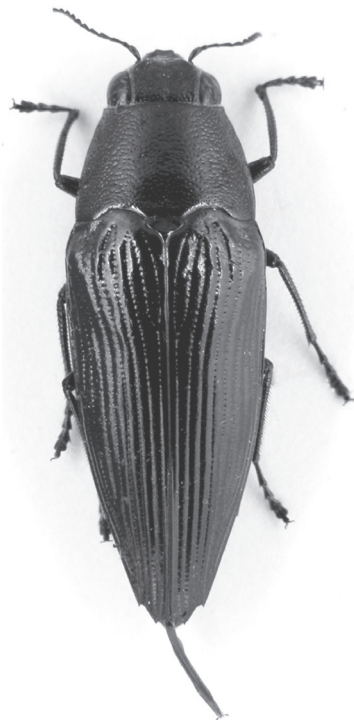
Fig. 7 - Female of Sphenoptera calcichroa Obenberger, 1914 found on Frankincense tree near Al Mughsayl in September 2002.

In October 2001, West of Mughsayl (16°51'N-53°42'E), we found under the bark of tall frankincense a large (length 41 mm) Elateridae larva not identifiable at species level (Fig. 8), that can be either a pest or a predator