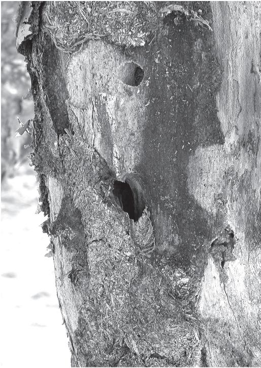
Fig. 3 - A dead trunk of Frankincense with several bores made by the long-horned beetle Neoplocaederus atlanticus with larvae still living inside (Wadi Adwnab16°56'N-53°49'E, IX 2002).