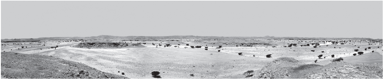
Fig. 1 - A 360° view of Wadi Dokha (17°19'N-54°05'E).