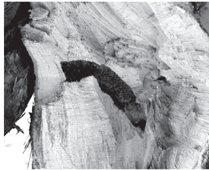
Fig. 4 - The end of the bore of Figure 3 where the living larva of the beetle Neoplocaederus atlanticus was found.