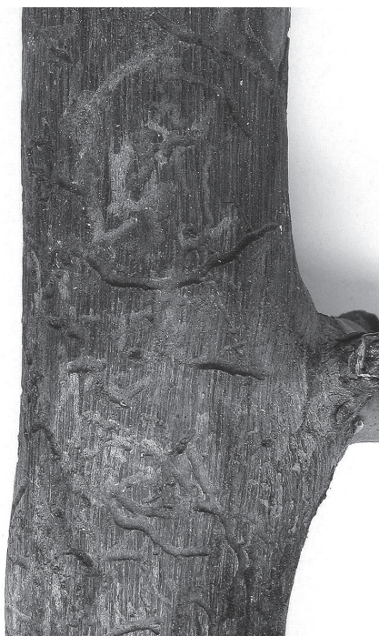
Fig. 9 - Twig of a dead Frankincense showing the attack of beetles, possibly of family Scolytidae.

of other insects and thus beneficial for the Frankincense tree.