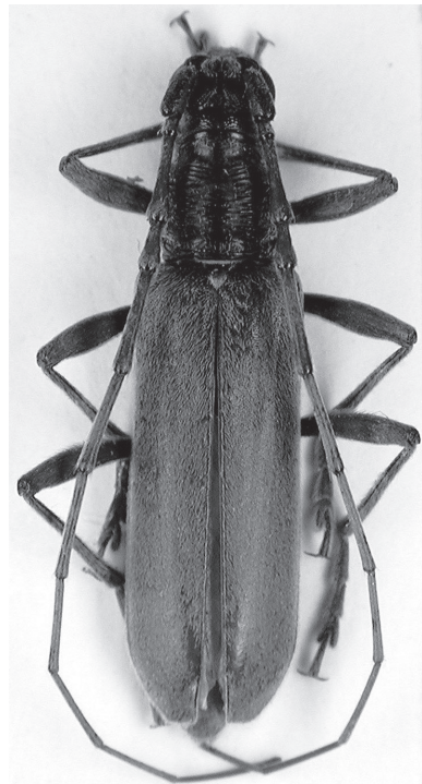
Fig. 6 - Male of Derolus martini ssp. hayekae Villiers, 1968 found in spring 2001 near Wadi Dokha.