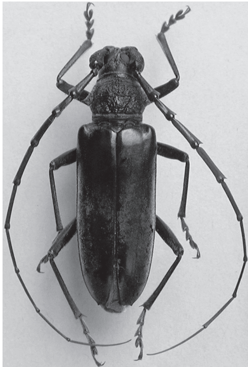
Fig. 2 - Specimen of Neoplocaederus atlanticus (Rungs, 1952) (Male, length 41 mm, Wadi Dokha XI-2000).

[MSNTC]; AlMughsayl env., 16°53'01"N-53°46'47"E, m 30, 1.III.2004, Leg. Dellacasa M. (Hg light), 3 exx. [MSNTC]; idem , 6.III.2004, Leg. Dellacasa M. (Hg light), 1 ex. [MSNTC]; Khor Rori env., 17°02'N-54°26'E, m 10, 11.III.2004, Leg. Dellacasa M. (Hg light), 2 exx. [MSNTC]; Rd 47, Wadi W of Al Mughsayl, 16°52'53"N-53°43'51"E, m 50, 1.III.2004, Leg. Dellacasa M., 1 ex. [MSNTC]; Rd. to Tawi Atayr, Wadi Hinna, 17°03'13"N-54°36'32"E, m 310, 8.III.2004, Leg. Dellacasa M., 4 exx. [MSNTC]; Wadi Darbat, bottom of waterfall, 17°04'27"N-54°25'53"E, 2.III.2004, Leg. Dellacasa M. (Hg light), 4 exx. [MSNTC]; Wadi Dowkha, 17°20'32"N-54°04'16"E, 5-9.III.2004, Leg. Dellacasa M. (UV light trap), 2 exx. [MSNTC].