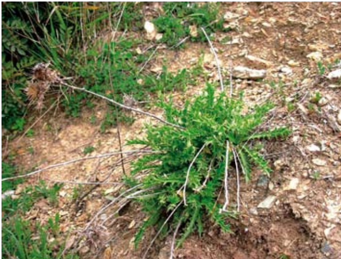
Figs 7-8 – Habitat of Trichoferus arenbergeri : mountain slopes (Orgosolo, Arcu Correboi) with Santolina corsica (7), stony ground with Carlina corymbosa (Nebida, Punta Mezzodi) (8) (Photograph: D. Sechi).

of the host plant or in the soil near it, as in Plagionotus floralis (Pallas, 1773) (Cherepanov 1990; Biscaccianti 2004), since no trace of the initial stages of larval activity has been observed in the stems or other exposed parts of the plant.