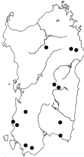
Fig. 9 – Distribution of Trichoferus arenbergeri (Sardinia).

During the first year, the young larva bores a descending gallery inside the tap root of the host plant, usually feeding out to near the tip, and fills it with powdery, compressed frass. This first period of larval activity does not cause the death of the plant. After hibernation, the larva starts to bore a new, ascending, broad feeding gallery filled with coarser frass intermixed with fibrous shreds and excrement, causing the death of the plant. Occasionally two or three larvae occur in the same plant: in these cases, short burrows bored in the lower region of stems have been observed as well. Once mature, usually in May, the larva enlarges the upper portion of the feeding gallery, making a large, elongated cell, where it pupates. According to the authors' observations, pupation requires 11-13 days.