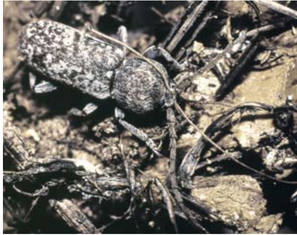
Fig. 1 – Male of Trichoferus arenbergeri just emerged from pupal cell.

Pronotum somewhat variable in shape, usually slightly transverse, subglobose, as broad as, or slightly broader than base of elytra, rounded to parallel-sided medially, regularly convex in lateral view but abruptly sloped apically; apical margin straight, usually more or less concealed under pronotal convexity, hind margin slightly bisinuate; disk dull, very densely punctate except for a smooth impression behind the middle, only occasionally obliterated; small simple punctures intermixed with larger umbilicate ones; pubescence sparser than that of head, converging to the prebasal impression; erect setae absent.