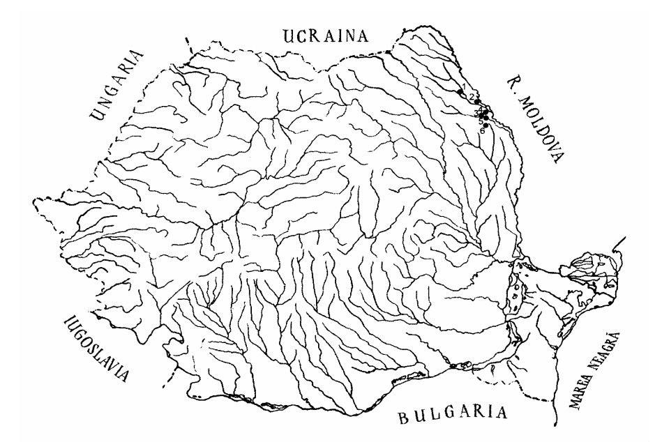
Figure 2. The distribution of Theophilea subcylindricollis in the Romania's fauna: 1 – Vlădeni; 2 – Probota; 3 – Valea lui David; 4 – Mârzești; 5 – Botanical Garden, Iași; 6 – Bârnova forest

It was recorded in Slovakia, Hungary, Ukraine, in the south of European Russia, Caucasus (Althoff & Danilevsky, 1997), Kazakhstan (Lobanov et all., 1982), Turkey (Pesarini & Sabbadini, 2004). We collected some specimens of T. subcylindricollis in some localities of Iaşi County, in the northern-eastern part of Romania (Figure. 2).