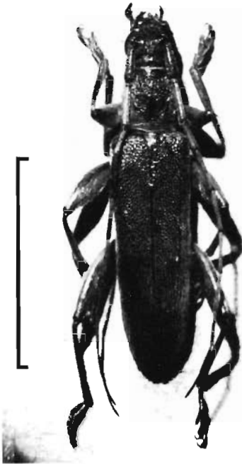
Fig. 1. Adult of Ceresium pachymerum (Pascoe) from dead wood of Hevea brasiliensis (Passam, East Sepik Province, Papua New Guinea, 15 July 1989, leg. T. J. Hawkeswood). Scale line : 10 mm.