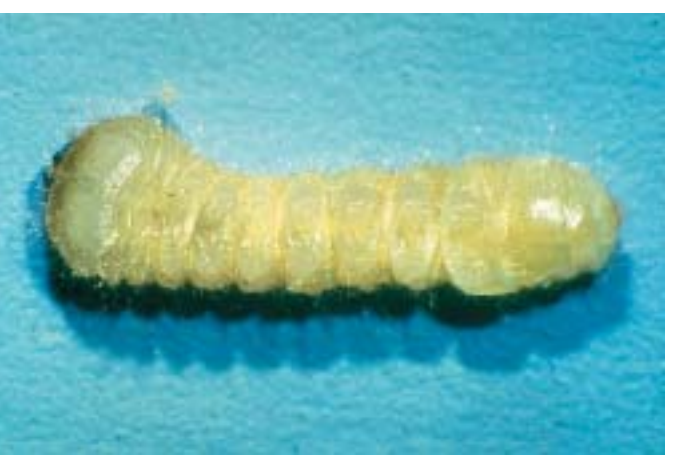
Twig girdler larva. (248)