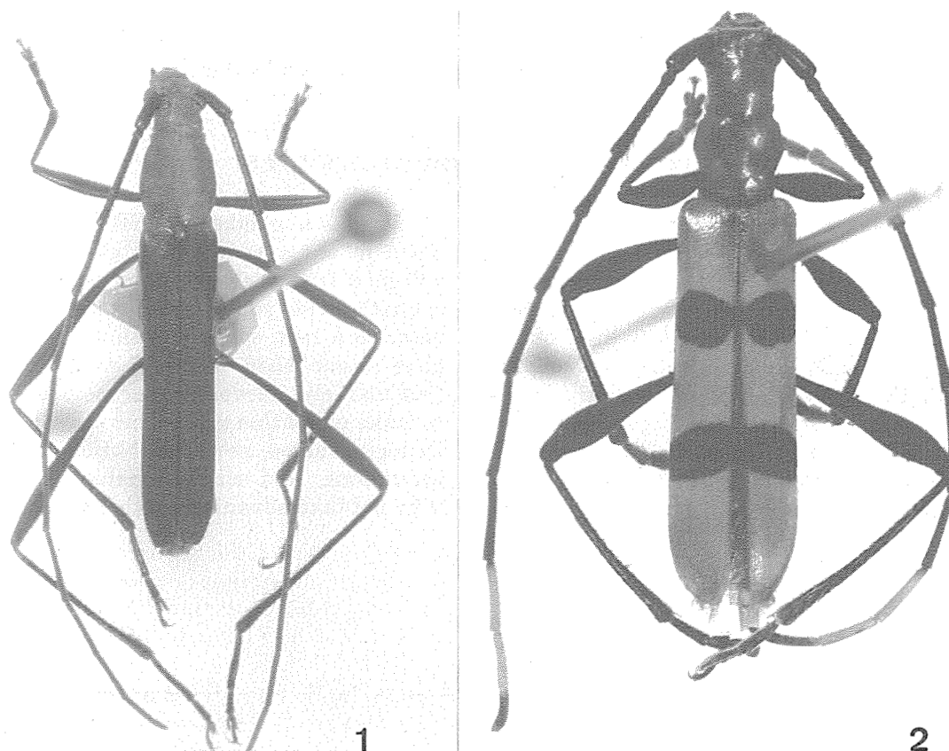
Figures 1 - 2. 1. Chariergus caeruleus , new species, holotype male; 2, C. paranaensis , new species, holotype male.