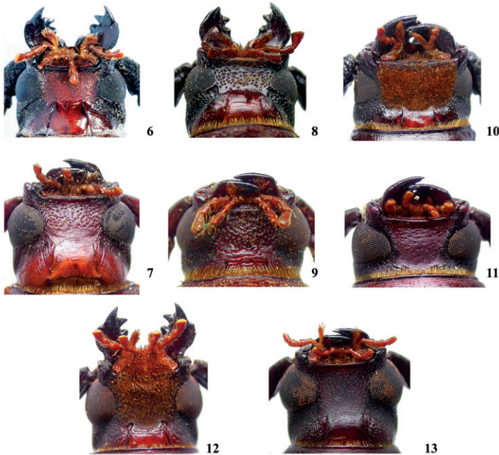
Figures 6–13. Head, ventral view: 6 Seticeros tunupai sp. n., holotype male 7 idem, paratype female 8 S. aquilus , male 9 idem, female 10 Chorenta reticulata , male 11 idem, female 12 C. biramiguelus (Santos-Silva, 2004), male 13 idem, female.

Despite the absence of specimens in southeastern Brazil and middle-eastern Argentina, the specimens collected in Bolivia are consistent with the specimens examined by us (more than 100 specimens from Brazil).