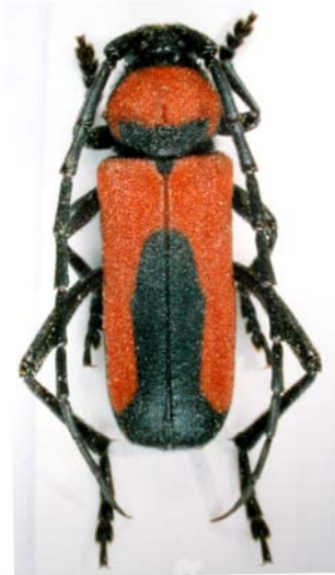
Fig. 5. Purpuricenus interscapillatus interscapillatus Plavilstshikov, 1937