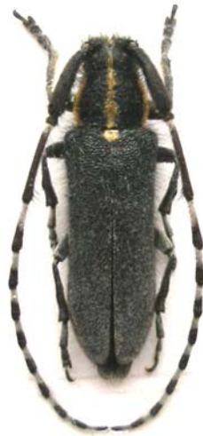
Fig. 9. Agapanthia (Agapanthia) orbachi Sama, 1993