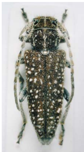
Fig. 11. Pilemia halperini (Holzschuh, 1999)