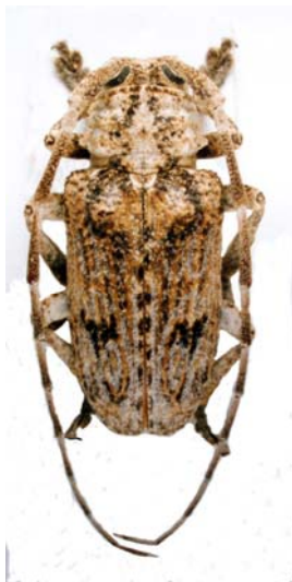
Fig. 6. Crossotus katbeh Sama, 2000