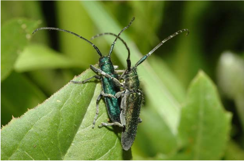
Fig. 8. Agapanthia (Agapanthia) lais Reiche & Saulcy, 1858