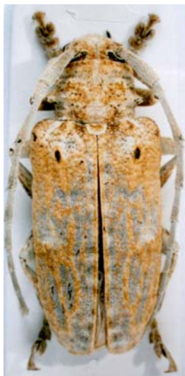
Fig. 7. Crossotus xanthoneurus Sama, 2000