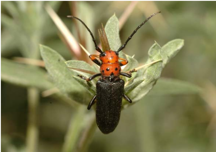
Fig. 13. Musaria wachanrui (Mulsant, 1851)