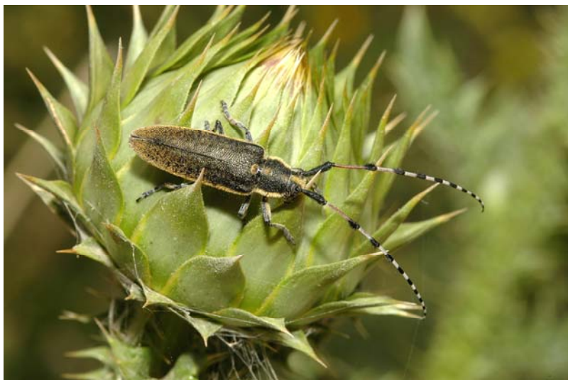
Fig. 10. Agapanthia (Epopetes) pustulifera Pic, 1905