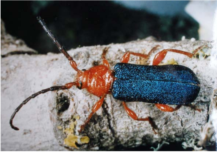
Fig. 4. Ropalopus ledereri ledereri (Fairmaire, 1866)