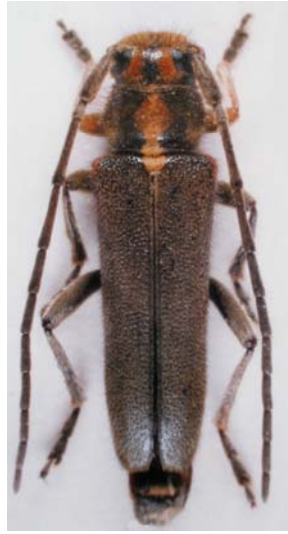
Fig. 12. Helladia insignata (Chevrolat, 1854) from Qartaba (Syria)