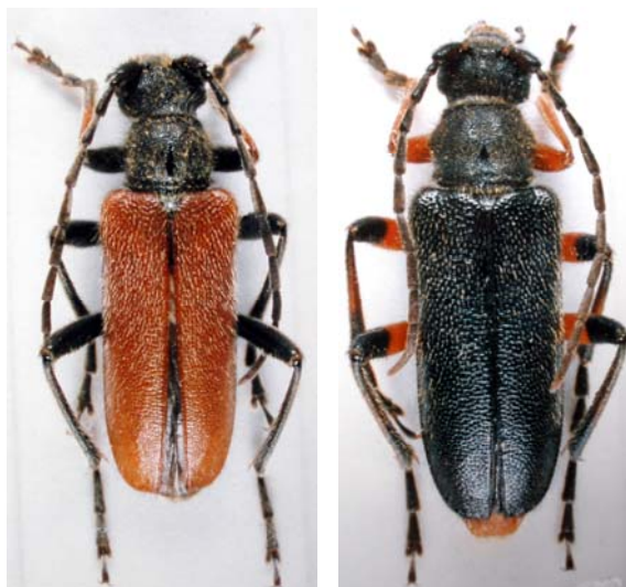
Fig. 2-3. Cortodera kochi Pic, 1935 ♂♂

Tavakilian, G., Montreuil, O. & Tauzin, P. 2007. A' propos de Rhaesus caesariensis (Pic, 1918) (Coleoptera, Cerambycidae, Prioninae). Bulletin de la Société entomologique de France , 112 (4): 511-513.