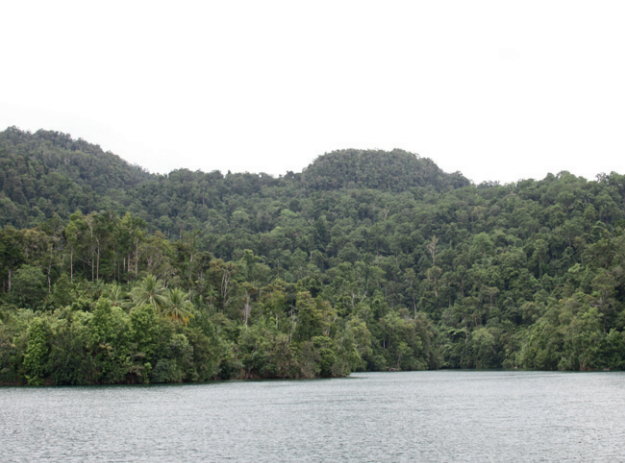
Figure 5. Coastal view in Triton Bay near Warika village in southern Bird's Neck, Indonesian Papua.