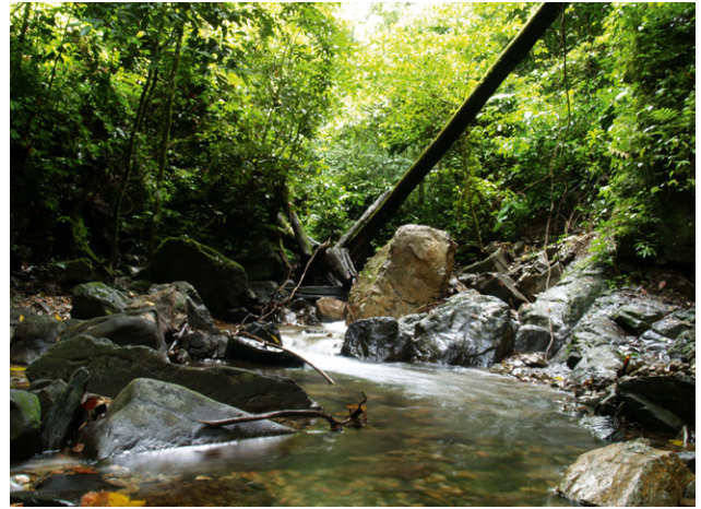
Figure 2. Acalolepta specimens were observed on green riverside vegetation in Hakau River valley, Misool.