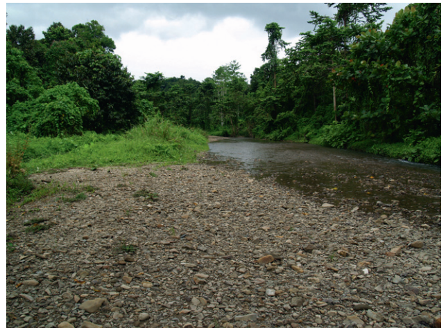
Figure 4. Acalolepta collecting locality in riverbed in Central Seram.