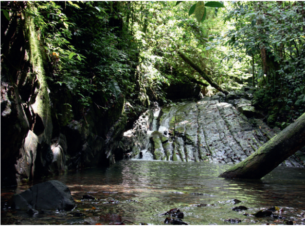
Figure 1. Primeval lowland dipterocarp rainforest in Hakau River valley near Aduway village, Misool.

VITALI F.: Notes on the genus Acalolepta Pascoe, 1858 from Indonesian Papua and the Moluccas