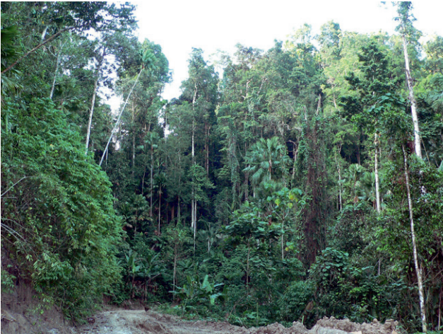
Figure 1. Primeval lowland rainforest in Oham area with new road under construction, South Halmahera.

VITALI F.: Notes on the genus Acalolepta Pascoe, 1858 from Indonesian Papua and the Moluccas