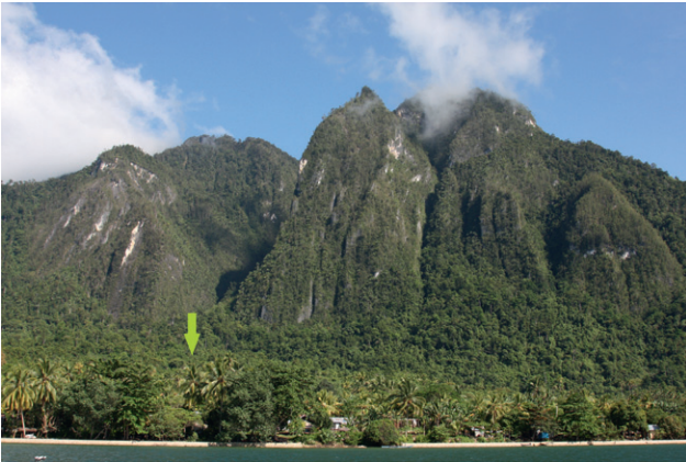
Figure 1. West Papua, Triton Bay, panoramic view of Lobo village with Mt. Lecyansir in background. Green arrow indicates sampling site.

VITALI F.: Notes on the genus Acalolepta Pascoe, 1858 from Indonesian Papua and the Moluccas