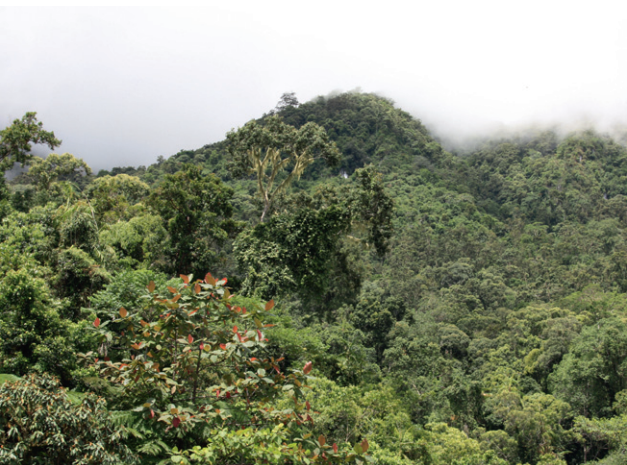
Figure 5. Midday rain cloud is moving down from Manusela Ridge in Central Seram.