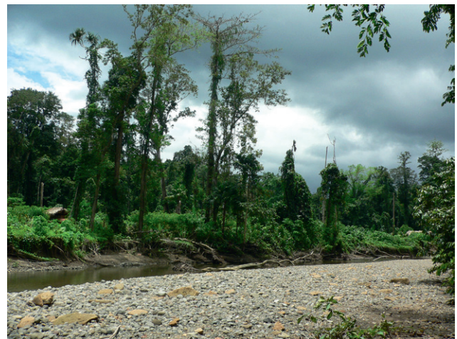
Figure 6. Riverside clearing & garden surrounded by primeval rainforest of Benteng Ridge, South Halmahera, is an ideal spot for observing Acalolepta.