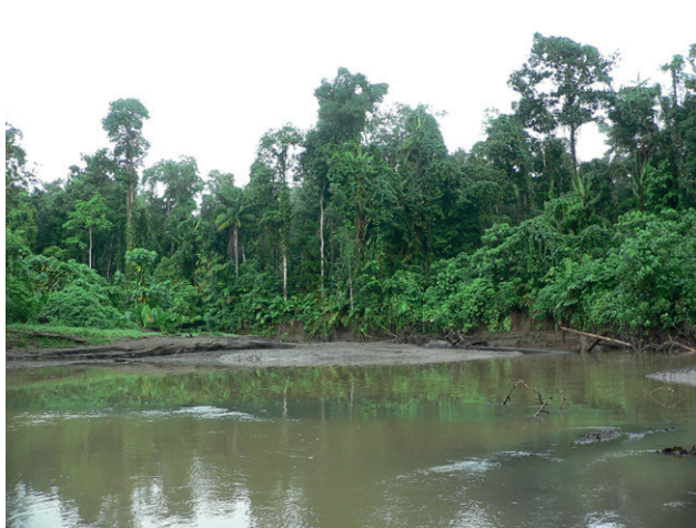
Figure 5. Primeval lowland dipterocarp rainforest on Benteng Ridge, South Halmahera.