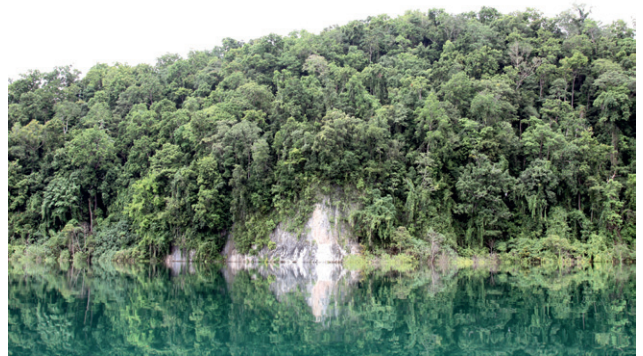
Figure 2. Several Acalolepta specimens observed near Lake Kamakawalar on southern Bird's Neck of Indonesian Papua.