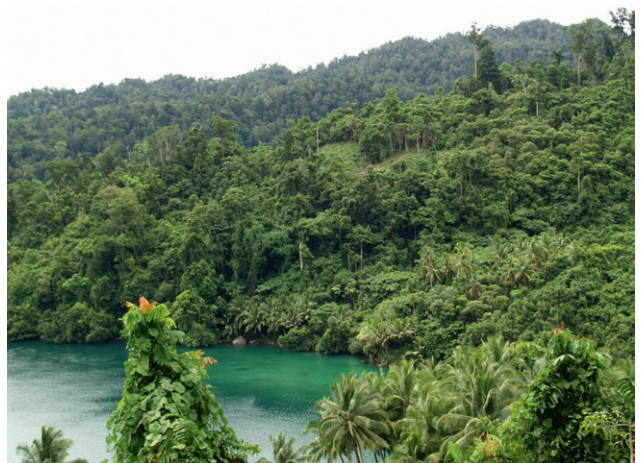
Figure 6. Small gardens and clearings around Warika village in Triton Bay, from where several Acalolepta specimens were recorded.