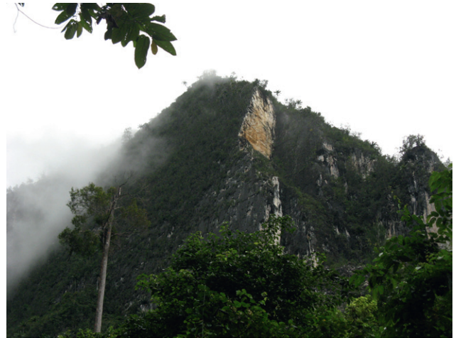
Figure 2. West Papua, Triton Bay, Lobo village, valley stream on Mt. Lecyansir.