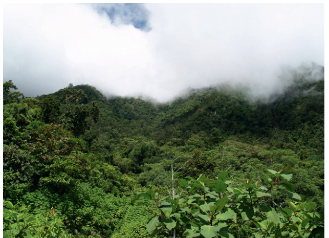
Figure 6. Sampling spot for Acalolepta in primeval rainforests of Manusela Ridge, Central Seram.