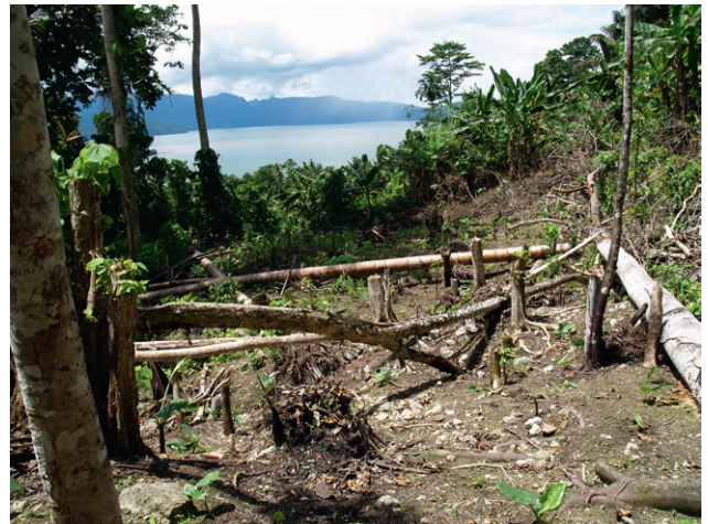
Figure 4. Small recent clearing established for a garden in primeval lowland rainforest in River Lengguru valley near Lobo.