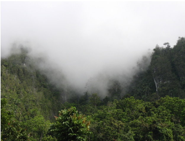
Figure 3. Midday fog moving from Mt. Lecyansir down to Lobo village, Triton Bay.