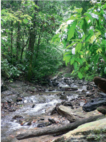
Figure 3. Primeval lowland dipterocarp rainforest in Hakau River valley near Aduway village, Misool, where Acalolepta specimens were observed.