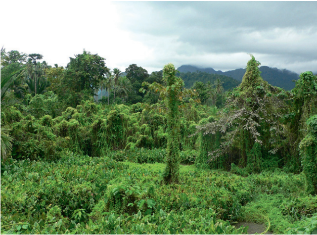
Figure 3. Lower bog near Horale village on north coast of Seram.