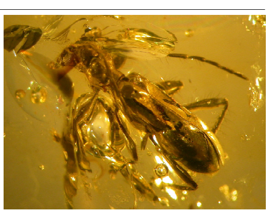
Fig. 6. Stenhomalus hoffeinsorum sp.nov. Habitus: dorsal-lateral view