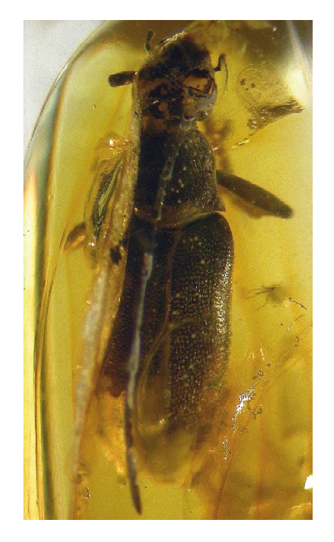
Fig. 2. Pedostrangalia (s. str.) pristina sp.nov.: dorsal view

Prothorax transverse, bell-shaped, regularly enlarged posteriorly, hind angles acute, embracing the elytral base; apex and basis finely grooved; disc feebly convex above, without longitudinal furrow, everywhere covered with a