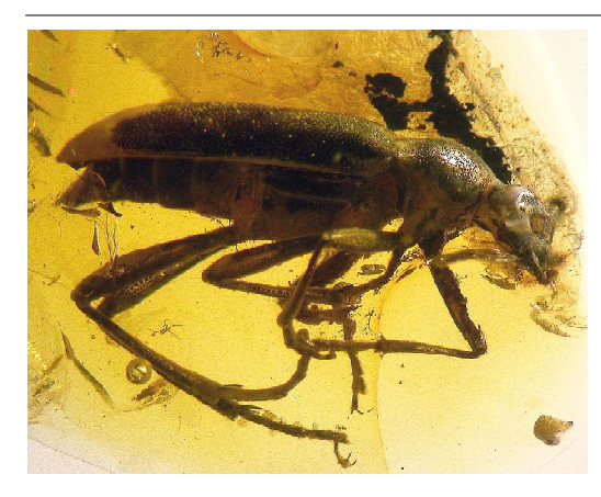
Fig. 1. Pedostrangalia (s. str.) pristina sp.nov.: lateral view