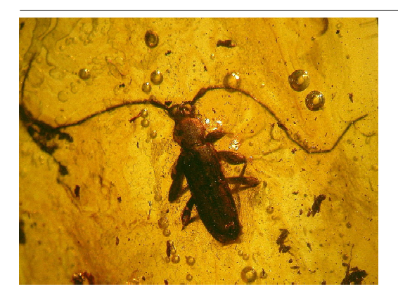
Fig. 4. Japanopsimus balticus sp.nov. Habitus: dorsal view