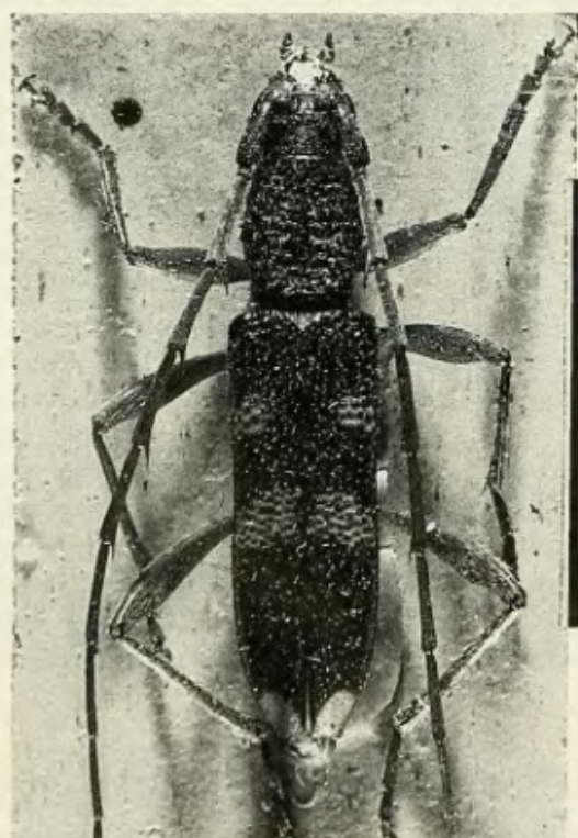
Fig. 1. Dorsal view of C. senio .

Coptocercus sexmaculatus Hope 1841a:51. — Hope 1841b:63, 1844:195; Aurivillius 1893:160, 1912:93 (synonymy).