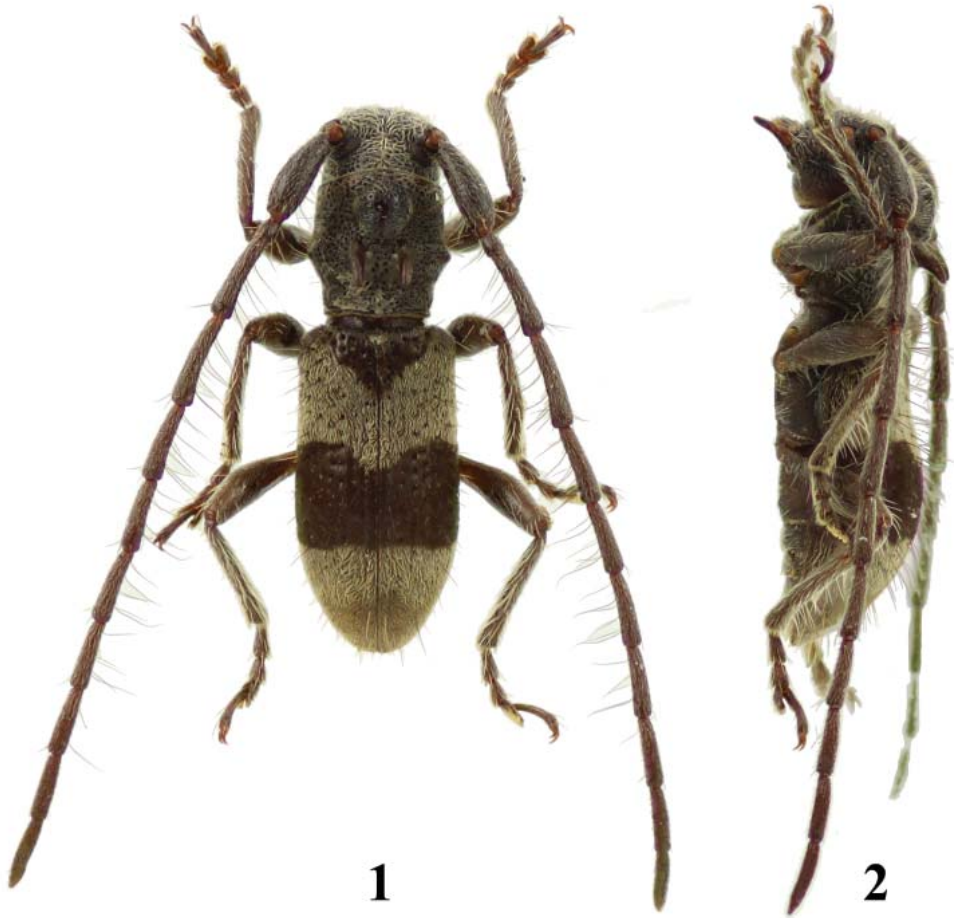
Figs. 1–2. Male habitus of Yimnashana wakaharai sp. nov. (holotype): 1 – dorsal view; 2 – lateral view.

about 1/7 length of tegmen, evenly and slightly narrowed apicad, with some long setae near apices and a few short setae on latero-dorsal side; apices rounded. Ringed part in dorsal view expanded laterad behind middle of tegmen, thence arcuately narrowed basad.